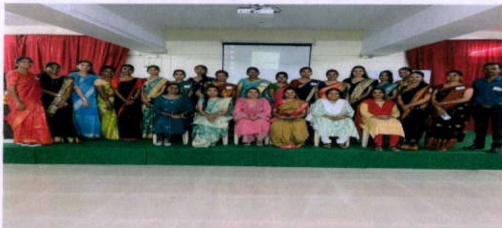
Participants of the Program