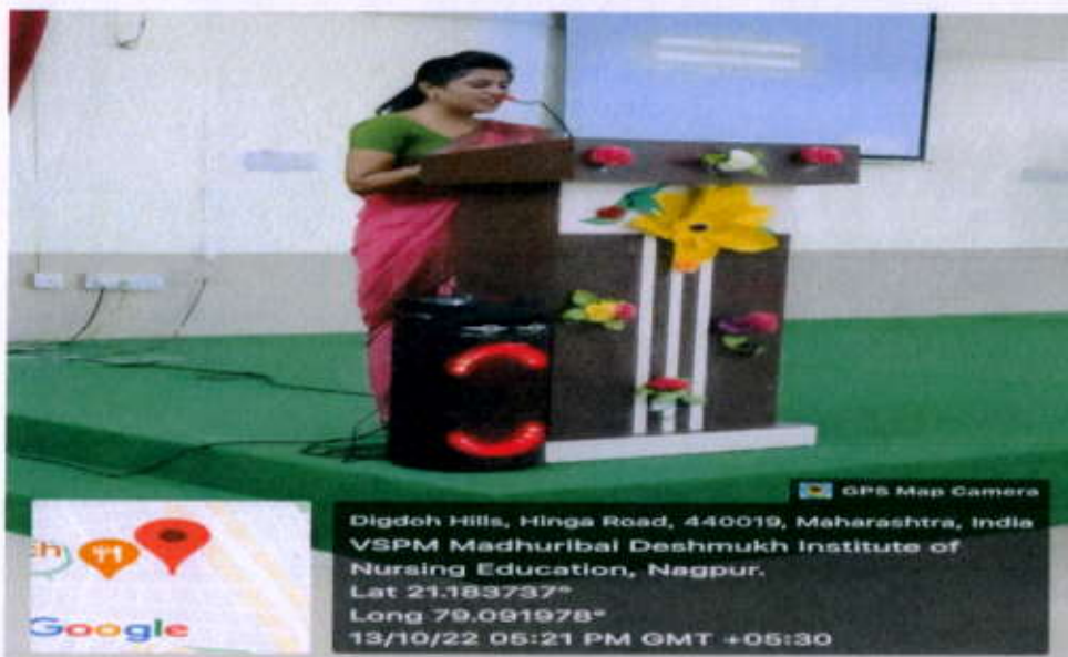
Scientific Paper Presentation